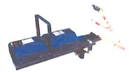
Optional heated swivel chute