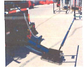
Optional drag box

A large burner, extensive heating surface area and precision thermostatic controls allow more heat to get into the material. Depending on the specific mastic, the Patcher II can melt 1,500 lbs (680 kg) per hour. That 200 gal (757 l) of mastic sealant will achieve 380°F (193°C) temperature and be ready to pour in 2 hours 1 . The Patcher II is the fastest mastic sealant melter available!