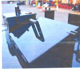
Dual lids allow for simultaneous loading and cleaning of the bucket