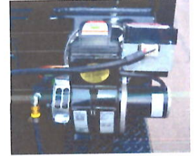
Fuel-efficient and easy-accessible burner