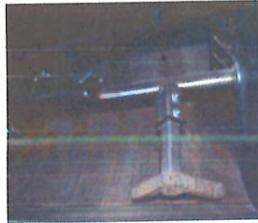
Angled agitation blades to blend and sustain aggregate suspension