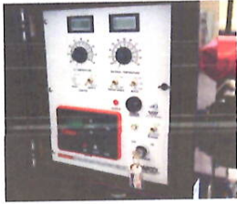
Digital controls for temperature accuracy